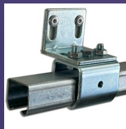
BRACKET AND SLIDING TRACK